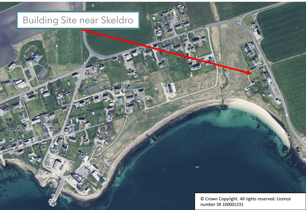
Building Site near Skeldro