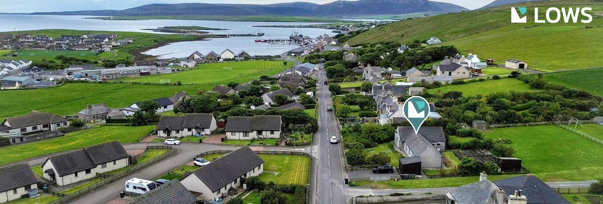
Elskafjor, 35 Hillside Road