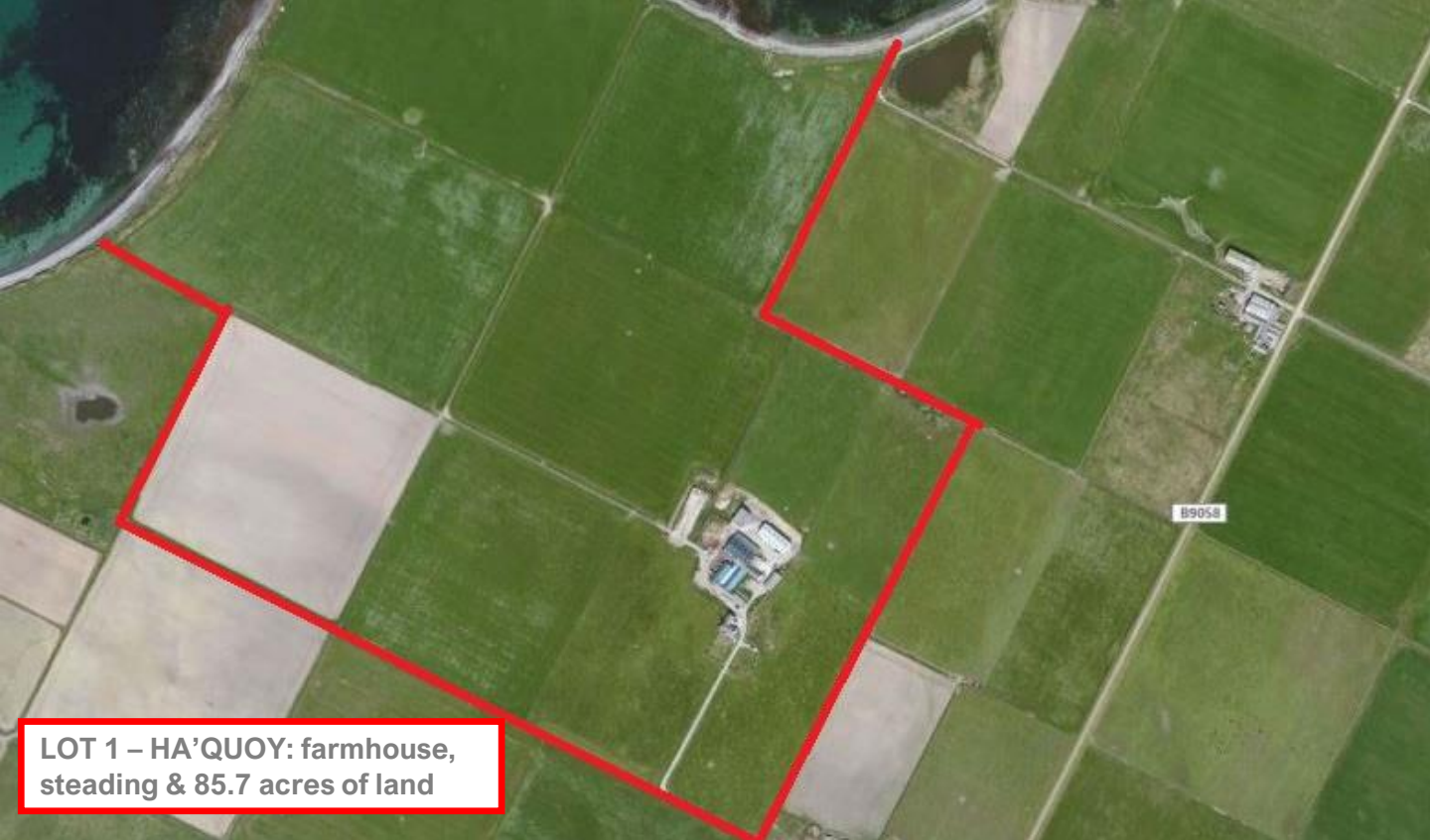
LOT 1 – HA'QUOY: farmhouse, steading & 85.7 acres of land