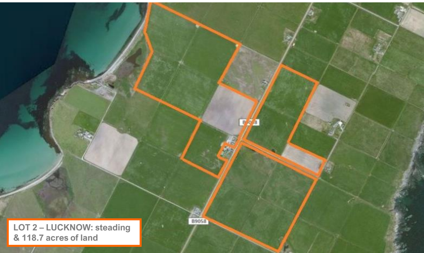
LOT 2 – LUCKNOW: steading & 118.7 acres of land