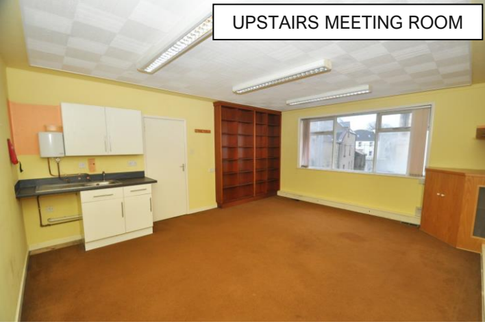
UPSTAIRS MEETING ROOM