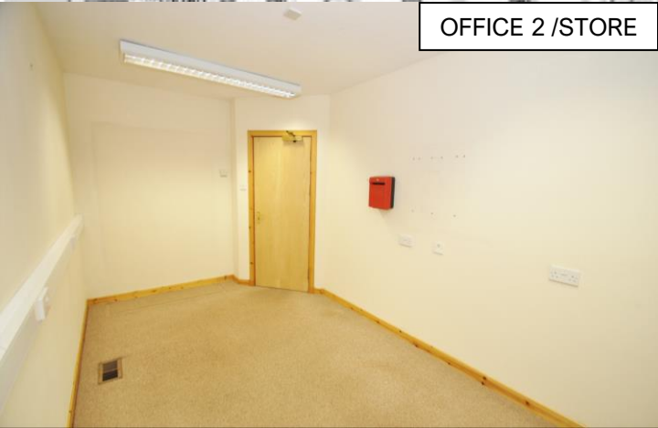
OFFICE 2 /STORE