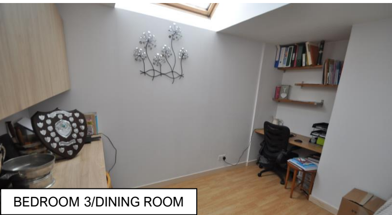
BEDROOM 3/DINING ROOM