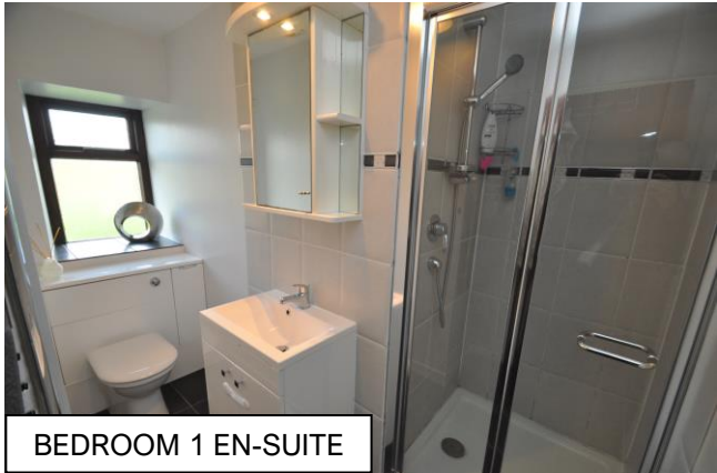
BEDROOM 1 EN-SUITE