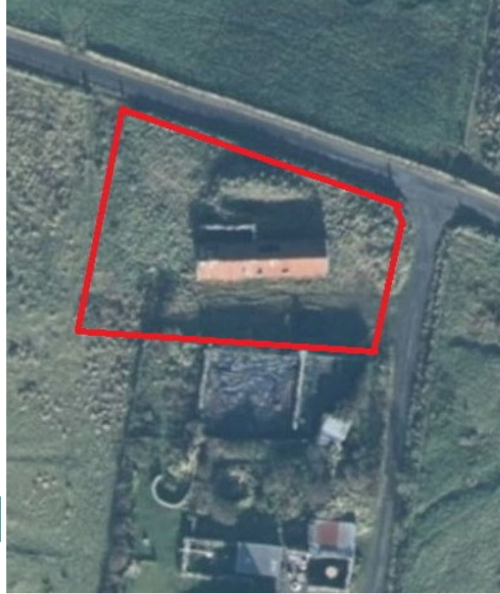
Area of Ground at Upper Bigswell, Sandwick